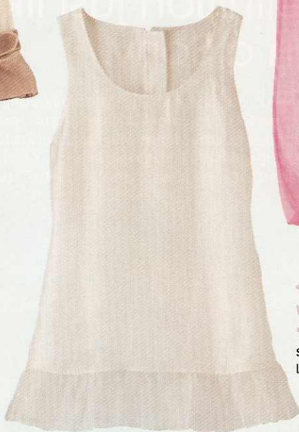
SILK TRENCH $402, BCBG Max Azria BCBG.COM FOR LOCATIONS

Sweet, and so good under a fitted, structured blazer