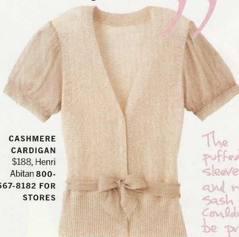
CASHMERE CARDIGAN $188, Henri Abitan 800- 567-8182 FOR STORES

“These airy, sheer fabrics have a delicate, dreamy quality that somehow feels really new.”