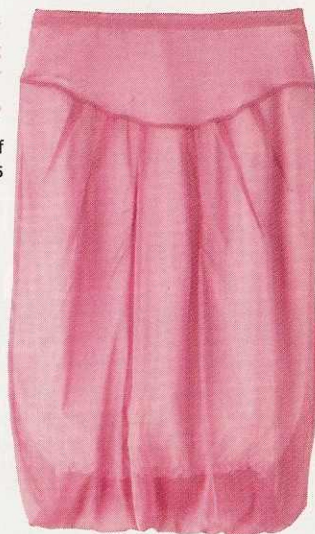
SILK SKIRT $575, Richard Chai. Bergdorf Goodman, NYC 800-558-1855

A stretch jersey Underlay makes this fancy skirt Super-comfortable