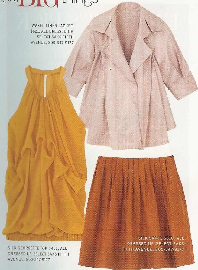
SILK GEORGETTE TOP, $452, ALL DRESSED UP, SELECT SAKS FIFTH AVENUE, 800-347-9177