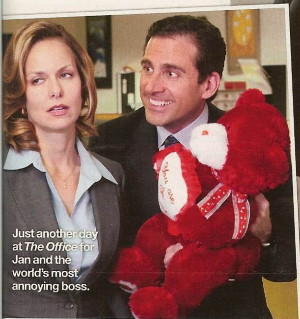
Just another day at The Office for Jan and the world's most annoying boss.

Because he's shameless about how much he adores her. Most men are intimidated by her, so it's nice for her to have a man who crashes through her